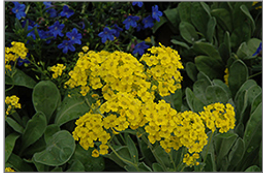
Basket Of Gold Alyssum flowers

Basket Of Gold Alyssum is recommended for the following landscape applications;