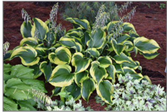
Atlantis Hosta

Atlantis Hosta is recommended for the following landscape applications;