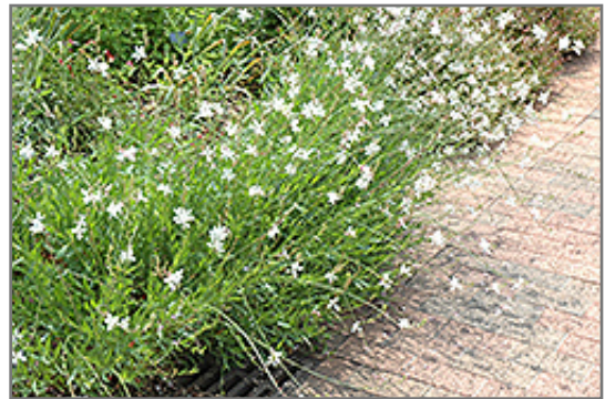
Whirling Butterflies Gaura in bloom