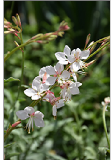
Whirling Butterflies Gaura flowers

This is a relatively low maintenance plant, and is best cleaned up in early spring before it resumes active growth for the season. It is a good choice for attracting butterflies to your yard, but is not particularly attractive to deer who tend to leave it alone in favor of tastier treats. It has no significant negative characteristics.