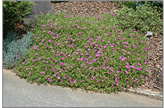
Purple Ice Plant in bloom

Purple Ice Plant will grow to be only 2 inches tall at maturity extending to 3 inches tall with the flowers, with a spread of 24 inches. Its foliage tends to remain low and dense right to the ground. It grows at a fast rate, and under ideal conditions can be expected to live for approximately 5 years. As an evergreen perennial, this plant will typically keep its form and foliage year-round.