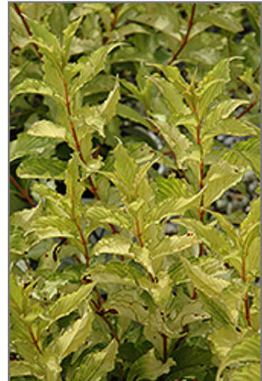
Ghost Weigela foliage