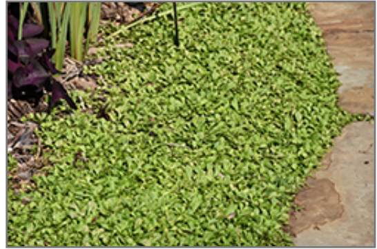
Creeping Mazus

Creeping Mazus will grow to be only 2 inches tall at maturity extending to 3 inches tall with the flowers, with a spread of 12 inches. Its foliage tends to remain low and dense right to the ground. It grows at a fast rate, and under ideal conditions can be expected to live for approximately 10 years. As an evergreen perennial, this plant will typically keep its form and foliage year-round.