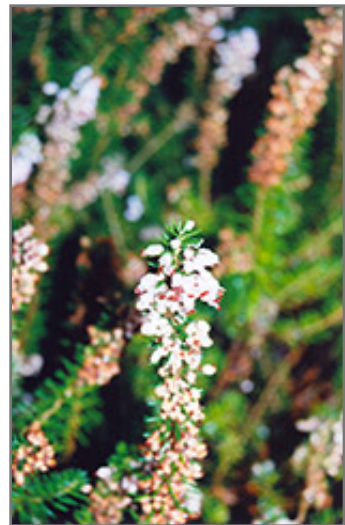
Scotch Heather flowers