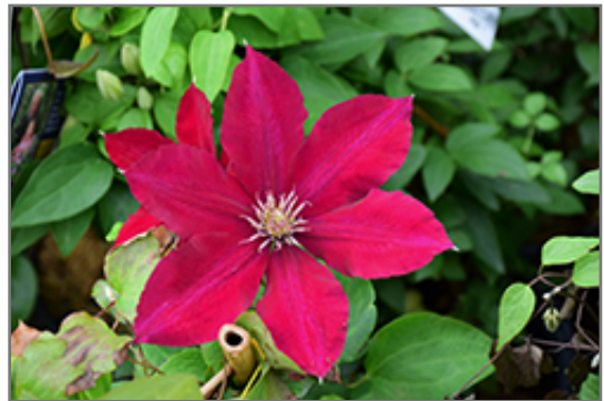
Rebecca Clematis flowers