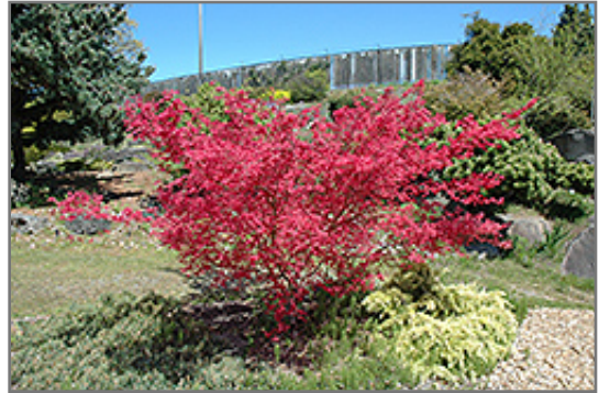
Shindeshojo Japanese Maple in spring

This tree does best in full sun to partial shade. You may want to keep it away from hot, dry locations that receive direct afternoon sun or which get reflected sunlight, such as against the south side of a white wall. It prefers to grow in average to moist conditions, and shouldn't be allowed to dry out. It is not particular as to soil pH, but grows best in rich soils. It is somewhat tolerant of urban pollution, and will benefit from being planted in a relatively sheltered location. Consider applying a thick mulch around the root zone in winter to protect it in exposed locations or colder microclimates. This is a selected variety of a species not originally from North America.