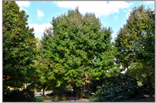
Autumn Flame Red Maple

This tree should only be grown in full sunlight. It is quite adaptable, preferring to grow in average to wet conditions, and will even tolerate some standing water. It is not particular as to soil type, but has a definite preference for acidic soils, and is subject to chlorosis (yellowing) of the foliage in alkaline soils. It is somewhat tolerant of urban pollution. This is a selection of a native North American species.