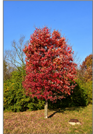
Autumn Flame Red Maple in fall