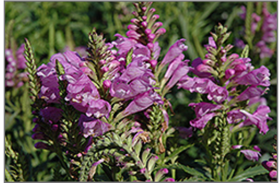
Vivid Obedient Plant flowers