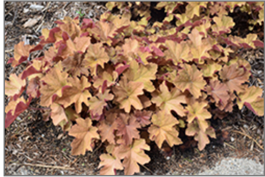
Caramel Coral Bells

Caramel Coral Bells will grow to be about 10 inches tall at maturity extending to 18 inches tall with the flowers, with a spread of 18 inches. When grown in masses or used as a bedding plant, individual plants should be spaced approximately 15 inches apart. Its foliage tends to remain low and dense right to the ground. It grows at a medium rate, and under ideal conditions can be expected to live for approximately 10 years. As an evergreen perennial, this plant will typically keep its form and foliage year-round.