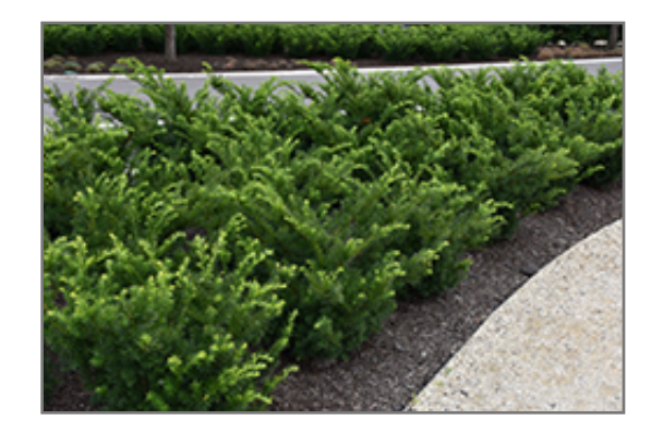
Densiformis Yew

Densiformis Yew is a dense multi-stemmed evergreen shrub with an upright spreading habit of growth. Its relatively fine texture sets it apart from other landscape plants with less refined foliage.