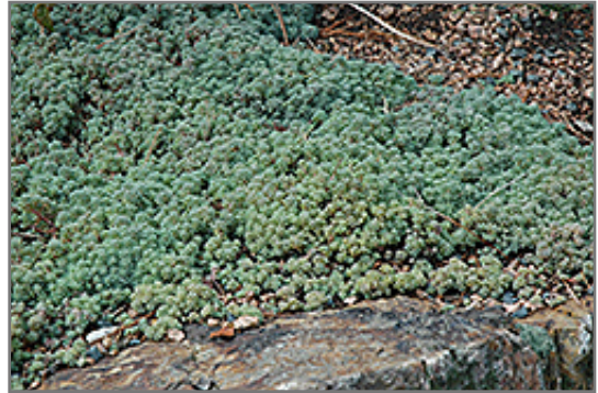
Spanish Stonecrop

Spanish Stonecrop is recommended for the following landscape applications;