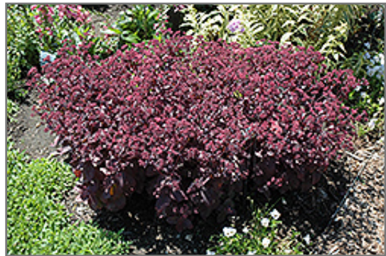
Xenox Stonecrop in bloom