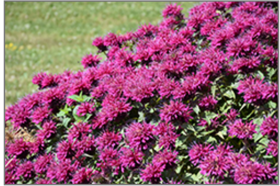
Grand Marshall Beebalm flowers

Grand Marshall Beebalm is recommended for the following landscape applications;