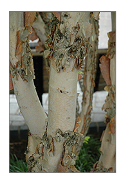
Fox Valley River Birch bark

Fox Valley River Birch is recommended for the following landscape applications;