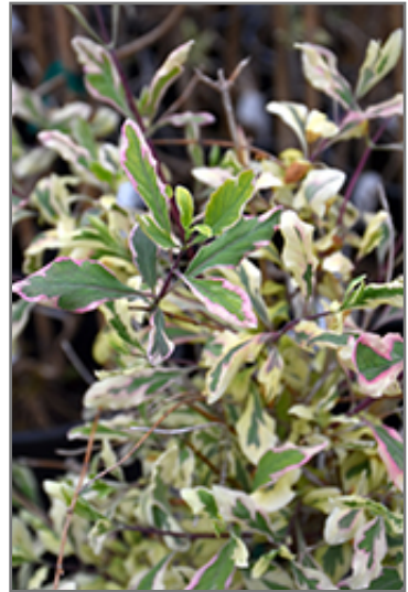
Harlequin Honeysuckle foliage