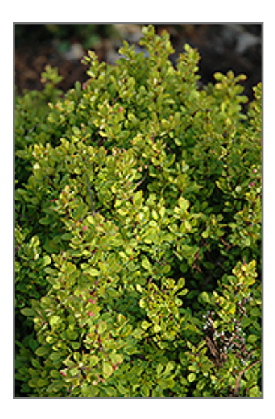
Golden Nugget Japanese Barberry foliage