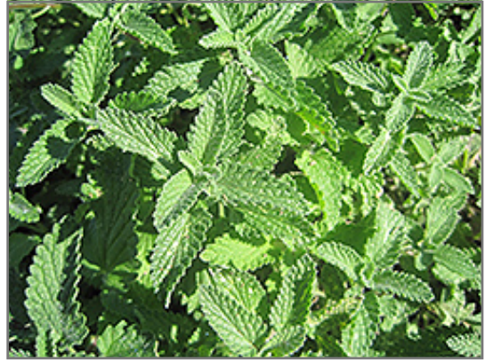
Walker's Low Catmint foliage

Walker's Low Catmint is a fine choice for the garden, but it is also a good selection for planting in outdoor pots and containers. It is often used as a 'filler' in the 'spiller-thriller-filler' container combination, providing a mass of flowers against which the thriller plants stand out. Note that when growing plants in outdoor containers and baskets, they may require more frequent waterings than they would in the yard or garden.