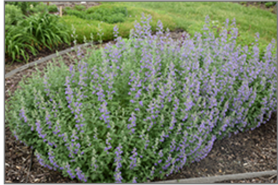
Walker's Low Catmint in bloom