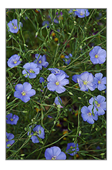
Perennial Flax flowers

Perennial Flax will grow to be about 24 inches tall at maturity, with a spread of 12 inches. When grown in masses or used as a bedding plant, individual plants should be spaced approximately 8 inches apart. It tends to be leggy, with a typical clearance of 1 foot from the ground, and should be underplanted with lower-growing perennials. It grows at a fast rate, and under ideal conditions can be expected to live for approximately 3 years. As an herbaceous perennial, this plant will usually die back to the crown each winter, and will regrow from the base each spring. Be careful not to disturb the crown in late winter when it may not be readily seen!