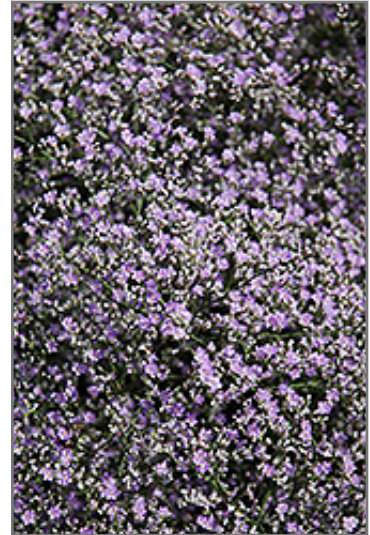
Sea Lavender flowers