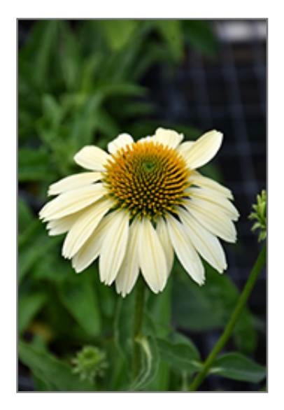
Mellow Yellows Coneflower flowers