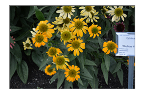
Mellow Yellows Coneflower flowers