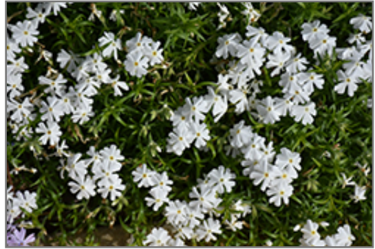
Spring White Moss Phlox flowers

Spring White Moss Phlox is recommended for the following landscape applications;