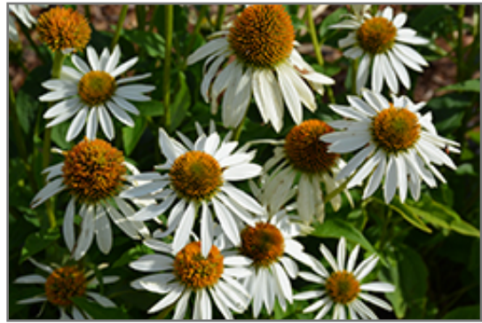
Happy Star Coneflower flowers

Happy Star Coneflower is recommended for the following landscape applications;