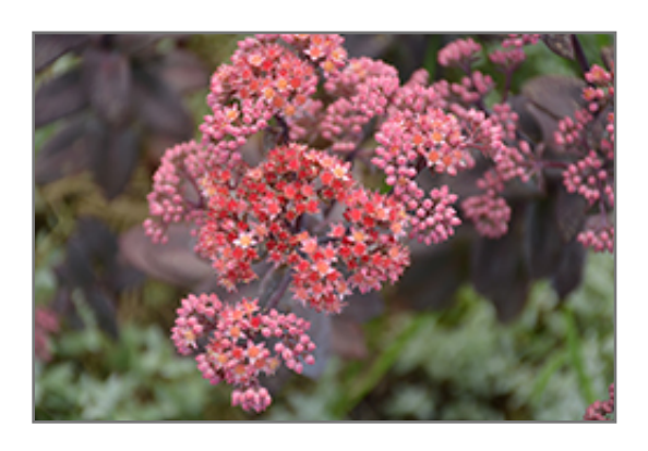
Night Embers Stonecrop flowers