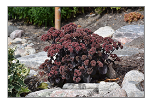
Night Embers Stonecrop in bloom

Night Embers Stonecrop is a dense herbaceous perennial with an upright spreading habit of growth. Its relatively coarse texture can be used to stand it apart from other garden plants with finer foliage.