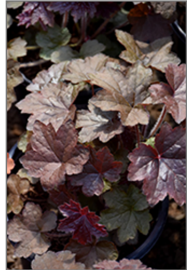
Palace Purple Coral Bells foliage

Palace Purple Coral Bells is recommended for the following landscape applications;