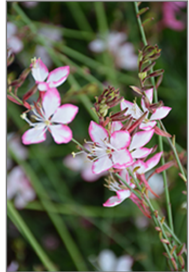
Rosy Jane Gaura flowers

Rosy Jane Gaura is recommended for the following landscape applications;