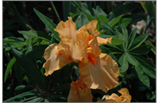
Orange Harvest Iris flowers