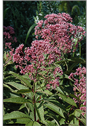
Gateway Joe Pye Weed flower buds

Gateway Joe Pye Weed is an herbaceous perennial with an upright spreading habit of growth. Its wonderfully bold, coarse texture can be very effective in a balanced garden composition.