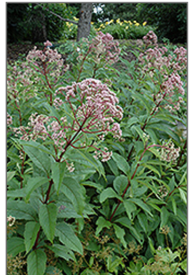
Gateway Joe Pye Weed flowers