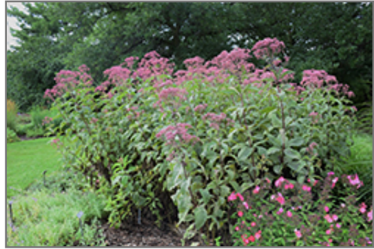
Gateway Joe Pye Weed in bloom