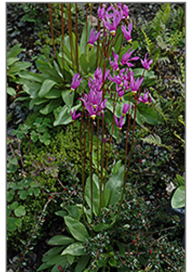
Shooting Star in bloom