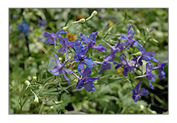
Blue Butterfly Delphinium flowers

Blue Butterfly Delphinium is recommended for the following landscape applications;