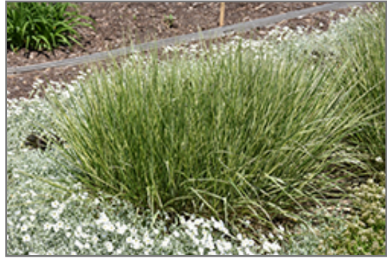
Variegated Reed Grass

Variegated Reed Grass is a fine choice for the garden, but it is also a good selection for planting in outdoor pots and containers. With its upright habit of growth, it is best suited for use as a 'thriller' in the 'spiller-thriller-filler' container combination; plant it near the center of the pot, surrounded by smaller plants and those that spill over the edges. It is even sizeable enough that it can be grown alone in a suitable container. Note that when growing plants in outdoor containers and baskets, they may require more frequent waterings than they would in the yard or garden.