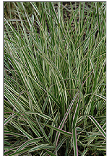
Variegated Reed Grass foliage