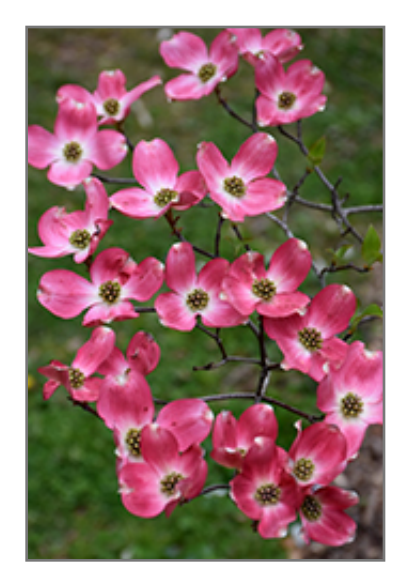
Red Flowering Dogwood flowers

Red Flowering Dogwood is a multi-stemmed deciduous tree with a stunning habit of growth which features almost oriental horizontally-tiered branches. Its average texture blends into the landscape, but can be balanced by one or two finer or coarser trees or shrubs for an effective composition.