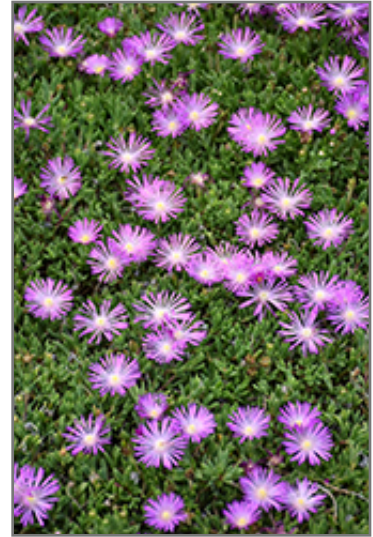
Table Mountain Ice Plant flowers

Table Mountain Ice Plant is a fine choice for the garden, but it is also a good selection for planting in outdoor pots and containers. Because of its spreading habit of growth, it is ideally suited for use as a 'spiller' in the 'spiller-thriller-filler' container combination; plant it near the edges where it can spill gracefully over the pot. Note that when growing plants in outdoor containers and baskets, they may require more frequent waterings than they would in the yard or garden.