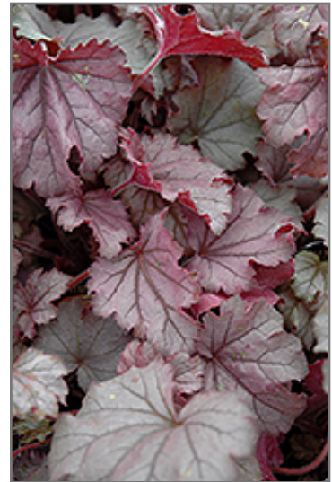
Little Cuties Sugar Berry Coral Bells foliage

Little Cuties Sugar Berry Coral Bells is recommended for the following landscape applications;