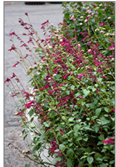
Wendy's Wish Sage flowers