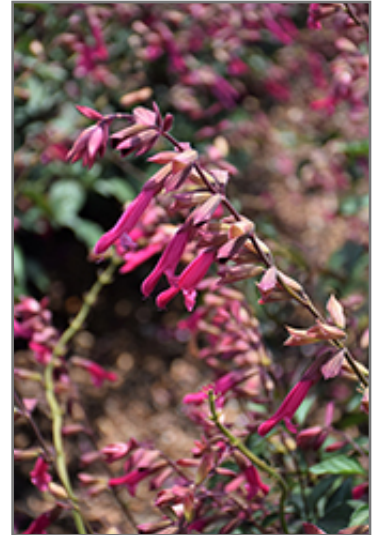
Wendy's Wish Sage flowers

Wendy's Wish Sage is recommended for the following landscape applications;