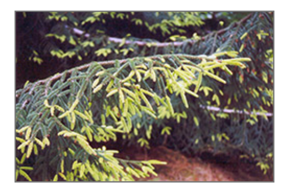
Golden Oriental Spruce foliage