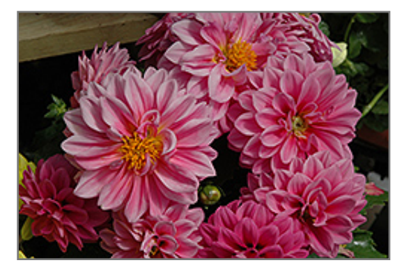
Dahlinova Hypnotica Pink Dahlia flowers

Dahlinova Hypnotica Pink Dahlia features showy hot pink daisy flowers with yellow eyes at the ends of the stems from mid to late summer. The flowers are excellent for cutting. Its serrated pointy leaves remain green in color throughout the season.