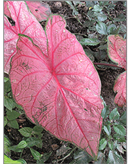
Fannie Munson Caladium foliage

Fannie Munson Caladium is recommended for the following landscape applications;