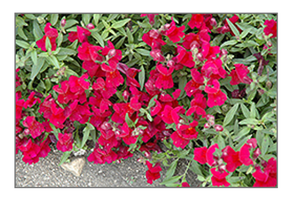
Candy Showers Deep Purple Snapdragon flowers

A smaller variety producing slightly fragrant violet flowers on a low, mounded and trailing habit; excellent for hanging baskets, but will also spread in garden beds; add it to a container mix