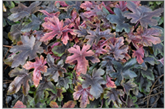
Brass Lantern Foamy Bells

Brass Lantern Foamy Bells is recommended for the following landscape applications;