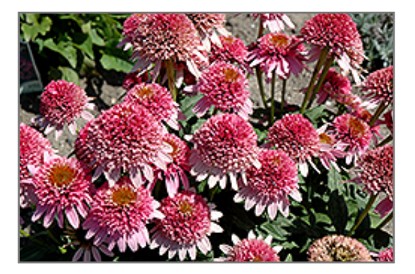
Butterfly Kisses Coneflower flowers