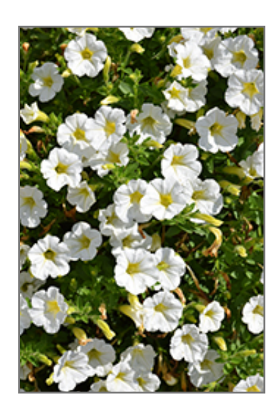
Littletunia White Grace Petunia flowers

Littletunia White Grace Petunia will grow to be about 12 inches tall at maturity, with a spread of 12 inches. When grown in masses or used as a bedding plant, individual plants should be spaced approximately 10 inches apart. Its foliage tends to remain dense right to the ground, not requiring facer plants in front. This fast-growing annual will normally live for one full growing season, needing replacement the following year.