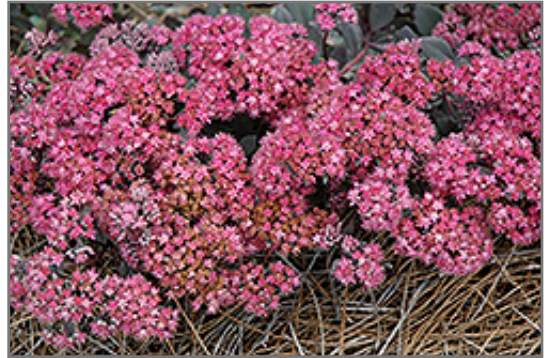
Dazzleberry Stonecrop flowers

Dazzleberry Stonecrop is a dense herbaceous perennial with an upright spreading habit of growth. Its medium texture blends into the garden, but can always be balanced by a couple of finer or coarser plants for an effective composition.