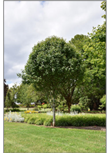
Jack Ornamental Pear

This tree should only be grown in full sunlight. It prefers to grow in average to moist conditions, and shouldn't be allowed to dry out. It is not particular as to soil type or pH. It is highly tolerant of urban pollution and will even thrive in inner city environments. This is a selected variety of a species not originally from North America.