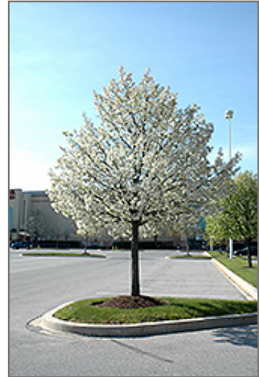
Jack Ornamental Pear in bloom