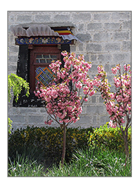
Japanese Flowering Cherry in bloom