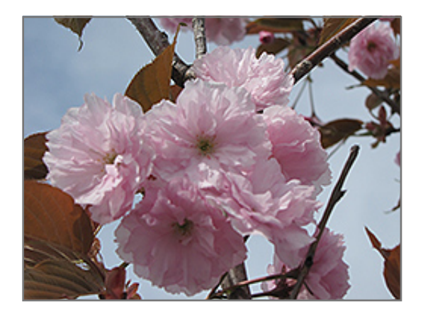
Japanese Flowering Cherry flowers