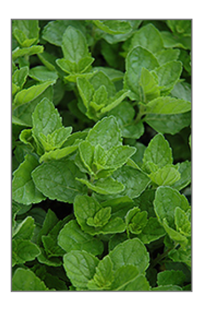
Spearmint foliage