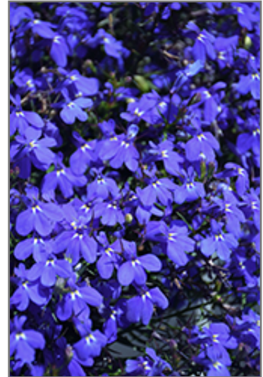
Techno Blue Lobelia flowers

Techno Blue Lobelia is recommended for the following landscape applications;