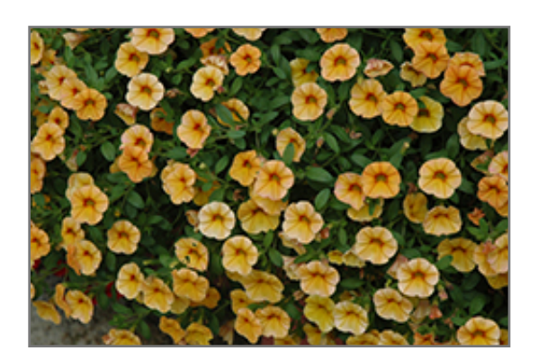
MiniFamous Tangerine Calibrachoa flowers